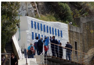
Inauguration of the Wall of Migrants – May 3, 2022